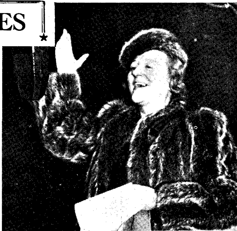
ALICE DELYSIA, famous French star of musical comedy and revue, broadcasts in the BBC's Overseas Service from an underground theatre in London