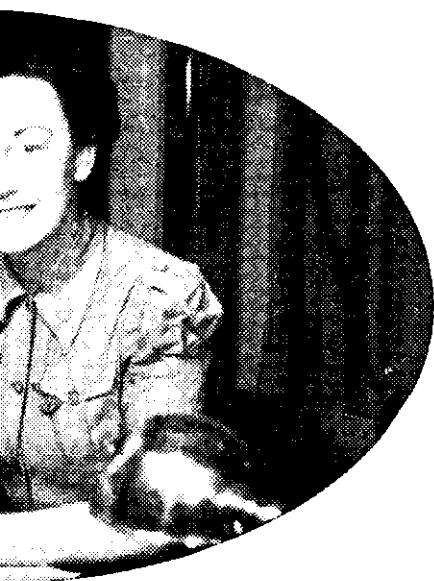
ducts Station 1ZB's "Bachelor Girl" morning at nine o'clock