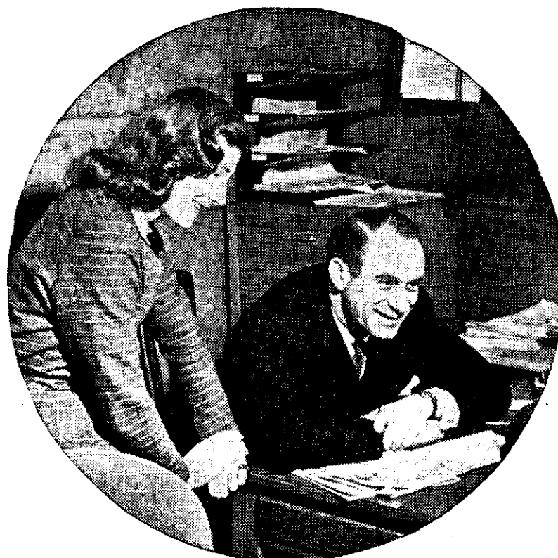
SARAH CHURCHILL, daughter of Britain's Prime Minister, and her comedian husband, Vic Oliver, run over their script for the "Starlight" feature in the BBC'S Overseas Service