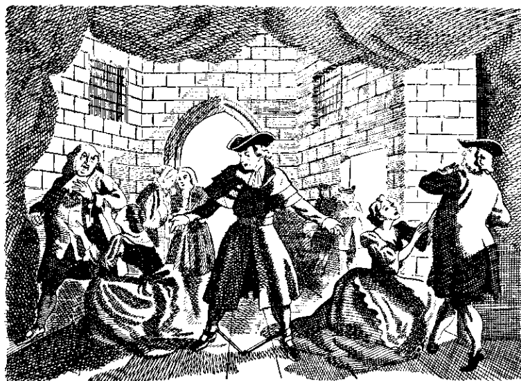
IN NEWGATE PRISON: The swashbuckling Captain Macheath finds two fair suppliants to plead for him. On Sunday, March 9, Station 2YA will broadcast "The Beggar's Opera," by Gay, with Michael Redgrave, better known to us as a film star, taking the role of Macheath