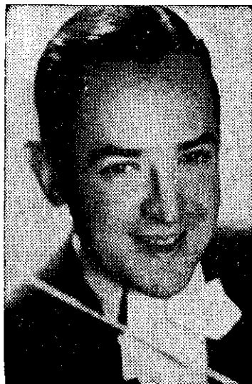
"FIFTEEN MINUTES with Jimmy Dorsey" is the title of an item from 2ZA at 8.15 p.m. on February 14. A photo of Dorsey appears above