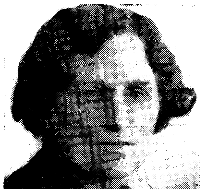
AUNT DAISY, of course, is known to every ZB listener. She is on the air every week-day