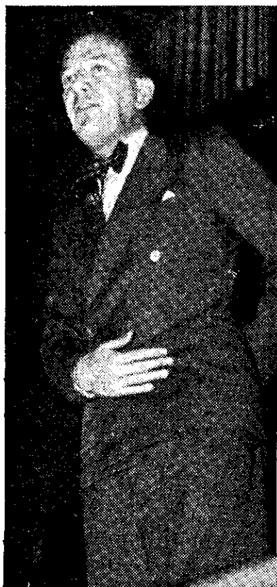
"HAS ANYBODY SEEN MY SHIP?" Another candid camera shot of Noel Coward entertaining Australian troops