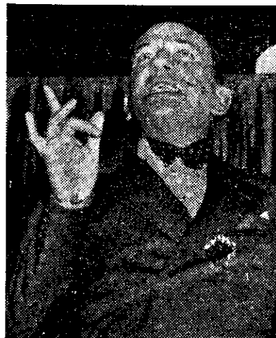
"DON'T PUT YOUR DAUGHTER on the Stage, Mrs. Worthington," was one of Noel Coward's most popular items at his Australian concerts. A candid view of Coward singing it to a Sydney audience