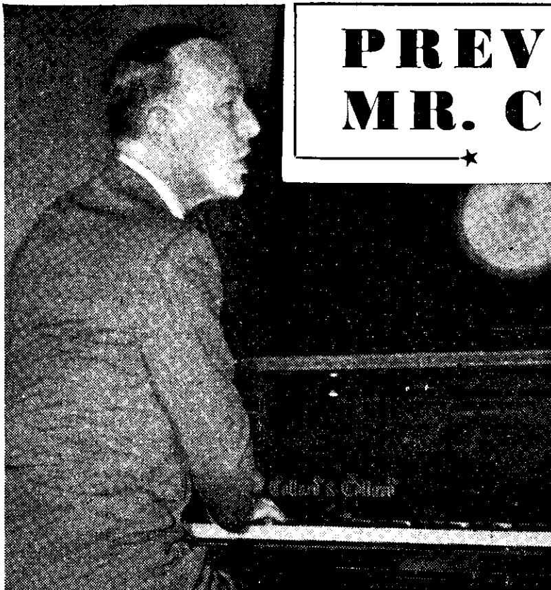
"MAD DOGS AND ENGLISHMEN Go Out in the Midday Sun." Noel Coward (above) singing his famous song at a concert given in Sydney. New Zealanders will also be given a straight-from-the-author rendering of the song