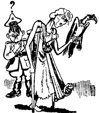
"What did we do with Fraulein Peace?"

"Well, what do you know about that! Peace has gone and bumped herself off," says Himmler. "She might have let us do it."