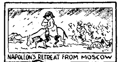
NAPOLION'S RETREAT FROM MOSCOW

"What's this?" says Hitler. "It's Peace," answers Himmler. "Sort of run down, you might say. Me and