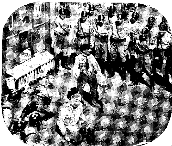
In Chaplin films the under-dog always gets his own back at least once in every 500 feet. Here Chaplin has come to the defence of a persecuted news-agent, and the Double Cross Troopers, very naturally, do not like his whitewash

"The Great Dictator" is heavily underscored with musical themes, conceived by Chaplin and executed by Meredith Willson, with whom Chaplin seems to be discussing a difficult point in this photograph. Last month the "Prelude to the Great Dictator" was played by the San Francisco Symphony Orchestra at the San Francisco World Fair. For this work, which critics found interesting, and "as obvious as most satirical attempts," Chaplin made up the four themes and left the orchestration to Willson. One sequence which Chaplin designed Willson thinks will be a hit. It is called "Boulevardier," and is the longest melody of them all, with 32 bars