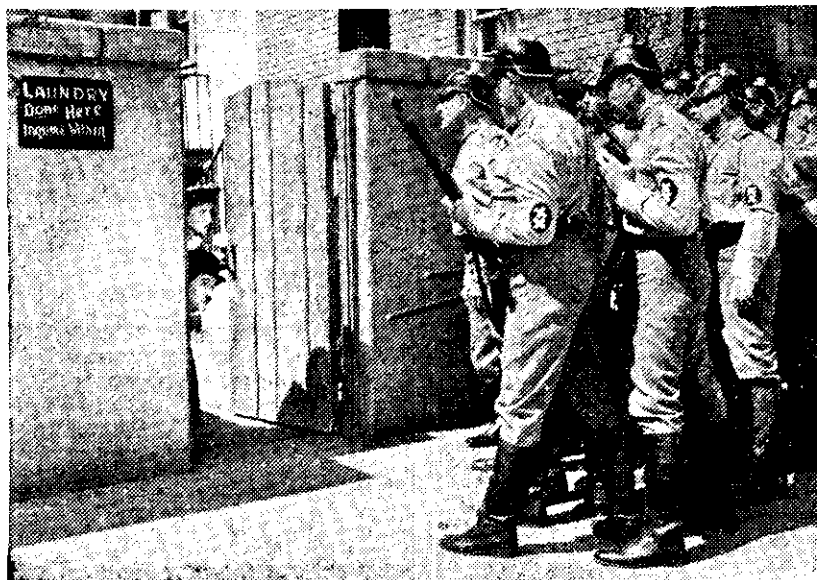
The little laundry girl (Paulette Goddard) and the little barber do not appear to be quite so well armed as the detachment of Double Cross Troopers