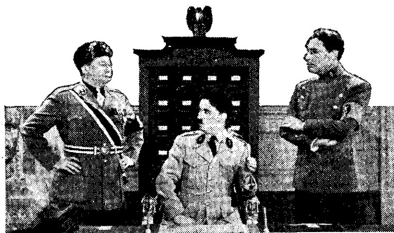
It might almost be thought that Jack Oakie was making a rude noise in this scene. The two dictators, Hynkel and Napaloni, are trying to browbeat one another. While the film was in the making, Oakie was two years away from all other studios