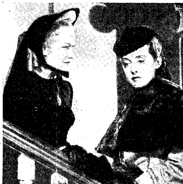
WOMEN WITHOUT HUSBANDS: Miriam Hopkins and Bette Davis in Warners' "The Old Maid"

But don't mistake me. In spite of its somewhat dreary theme and daguerreotype settings "The Old Maid" is a well produced and interesting picture—competent, perhaps, rather than inspired, but often remarkably life-like. As the scheming egotist of a cousin, Miriam Hopkins does an even more efficient job than Bette Davis and even succeeds toward the end in winning some of your sympathy for her character. George Brent's appearance is very brief but not unimportant (from motives of delicacy I'll not elaborate). He is the only man of note in the story. Didn't I call it a "woman's picture"?