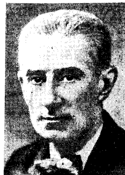
COMPOSITIONS by Ravel (above), with Debussy interludes by Maggie Teyte, will be heard from 4YO on August 30, at 8.0 p.m.