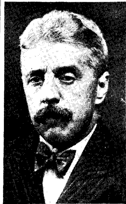
ARNOLD BENNETT: His comedy, "Cupid and Commonsense," adapted and produced by the NBS, will be heard from 4YA on Sunday evening, July 14, beginning at 9.15.