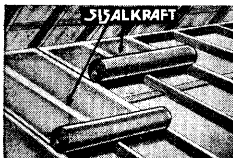
SARKING FIXED ON TOP OF JOINTS