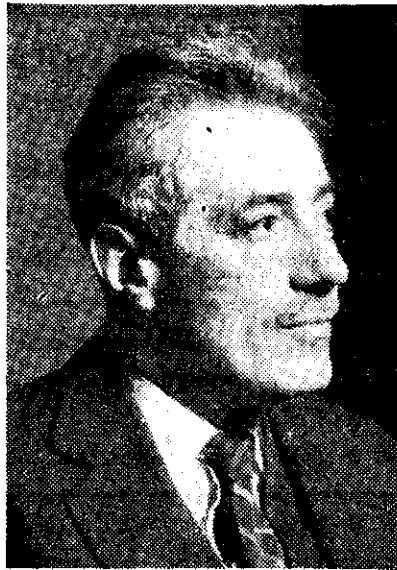
HIGHLIGHT of the concerto programme from 2YC on July 3 will be Brahms' "Concerto in D Major, Op. 77," in which the solo violinist will be Fritz Kreisler (above). It will be heard at 9.21