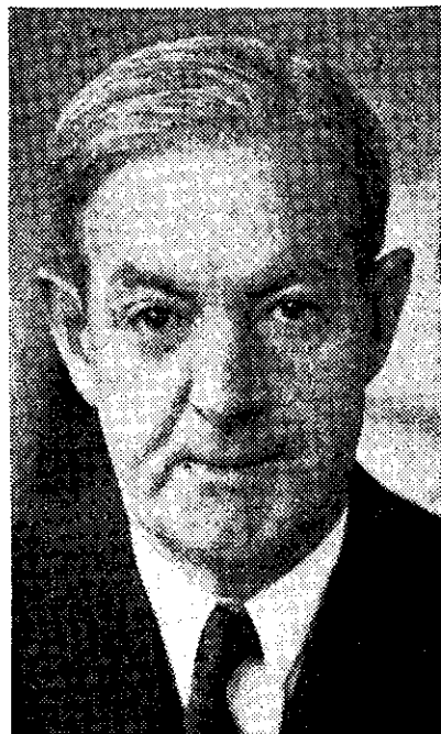
SIR HAMILTON HARTY, who conducts the London Philharmonic Orchestra in a recorded presentation of Mozart's "Divertimento No. 17 in D Major," which will be heard from 2YC on July 2