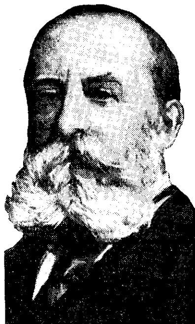
SAINT-SAENS: His "Carnival of the Animals" Suite is to be heard from 2YC on Wednesday evening, June 12, played by the Philadelphia Symphony Orches- tra