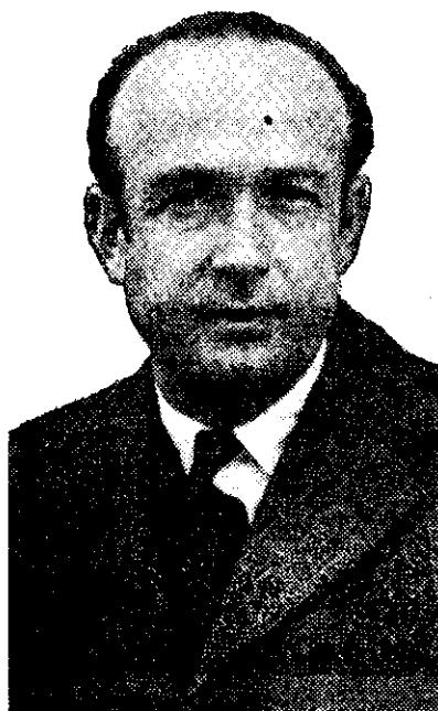
JOSEPH SZIGETI (violinist), will contribute to the evening programme from 2YN on Monday, June 10