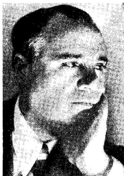
BENIAMINO GIGLI , the Italian tenor, will be heard in solos and a duet from 2YH in the Sunday evening concert programme on June 9