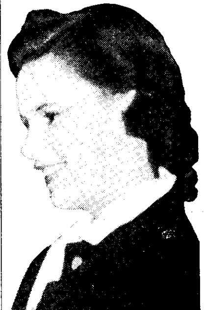
JUDY GARLAND, the young American singer and film star, who will be heard from 1YX on June 8 in numbers from "The Wizard of Oz." She will be accompanied by Gray Gordon's Orchestra. Tune in at 8 p.m.

"Charming Chloe" . German "Rain" ..... Curran