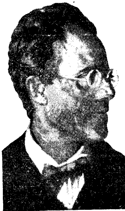
MAHLER: The third and fourth movements of his "Symphony No. 9" will be heard from 2YC on Wednesday evening, May 29, played by the Vienna Philharmonic Orchestra