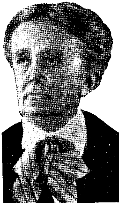
"MUSIC SINCE 1900," the 2YA Sunday afternoon programme features, on May 26, "The Wreckers," by Dame Ethel Smyth (above). The session is on the air at 2 p.m.