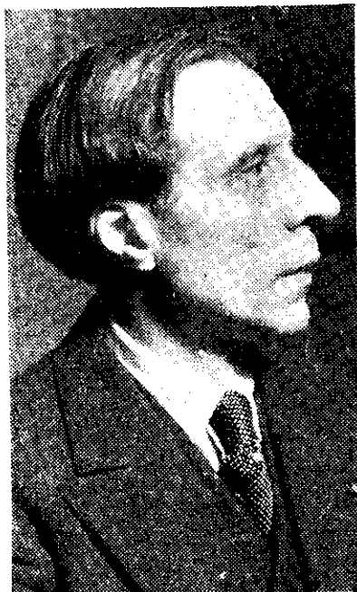
DEBUSSY'S "Fêtes Galantes" will be presented from 1YX on Tuesday evening, May 14, by the pianist, Alfred Cortot (above), and Maggie Teyte (soprano).