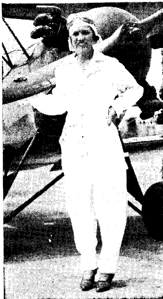
JACQUELINE COCHRAN, the American aviatrix who is to speak in the "Music and Flowers" series from 2YA on Saturday forenoon, May 11. Her subject is, of course, to be "Flying and Flowers." She will be on the air at 10.45 a.m.

The Far East Comes Nearer + Flying And Flowers + Political Recollections