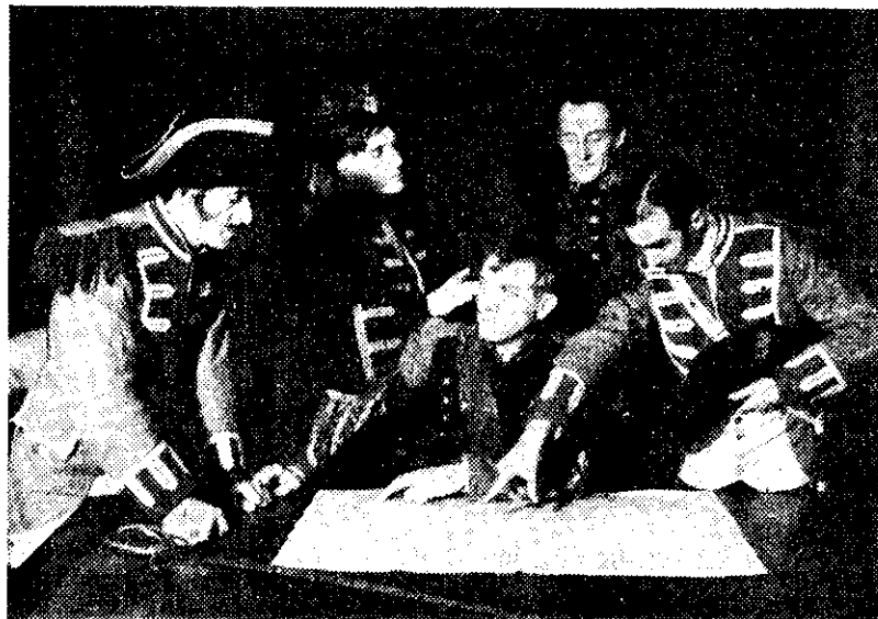
"Long Live the Emperor!" Napoleon Bonaparte discusses plans for a campaign with Junot, Marat and other officers

Eventually appointed to the command of one of the French Armies, he soon took charge, by degrees, of the political situation, and when the French began to tire of the Republican system of government, Napoleon was so strongly