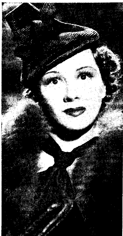
GLADYS SWARTHOUT, film-star and operatic mezzo-soprano is "easy to look at" as well as delightful to hear. She is featured on a recital programme to be broadcast from 3YL on Friday evening May 3, at 10 p.m.

Baritone Ballads + Opera And Film Star + Wings Of The Morning