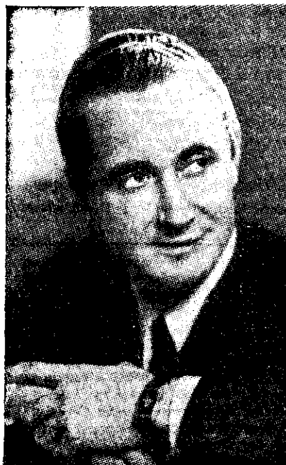
OPERA, concert, radio and motion picture tenor is Nino Martini (above), who is featured on a recital programme from 3YL on Monday evening, April 29. The programme opens at 10. 0.