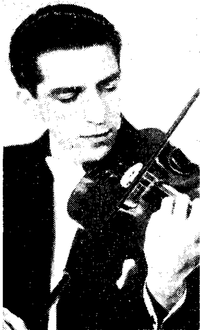
MANTOVANI and his violin. His orchestra will be heard in the concert programme from IYA on Monday evening, April 8