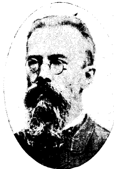
RIMSKY-KORSAKOV: His "Scheherazade Symphonic Suite, Op. 35," played by the Philadelphia Orchestra, under Leopold Stokowski, will be presented from 4Y0 on Wednesday evening, April 10