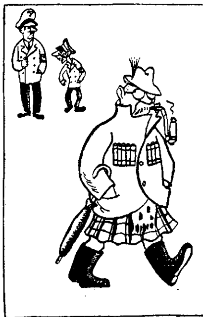
—“Candide,” Paris. He is an agent of the Gestapo pretending to be working for the British Intelligence Service in betraying the Russian OGPU for the benefit of the French Sureté

Hitler has taken the day off to visit a mental hospital. The inmates are lined up in groups to meet him. As he arrives before the first group they all lift their arms and cry “Heil Hitler.” All except one, who doesn't move. Hitler turns to him angrily, demanding to know why he doesn't give the official salute. “But I'm not mad,” protests this individual, “I'm the warder.”—Gringoire.