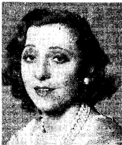
OSCAR STRAUS songs from the film "The Three Waltzes," will be presented from 3ZR on Sunday evening, March 31, by Yvonne Printemps (above), the French soprano