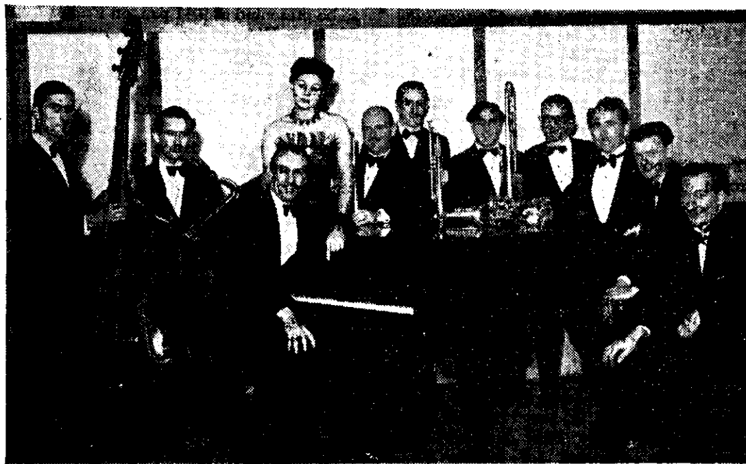
MEMBERS of the Rhythm Makers Concert Party, who have been presenting weekly comedy sessions from the NBS Exhibition Studio. Their weekly feature, which is customarily presented "Every Friday Night At Eight" will, in Easter week, be heard at that hour on Saturday evening (March 23)