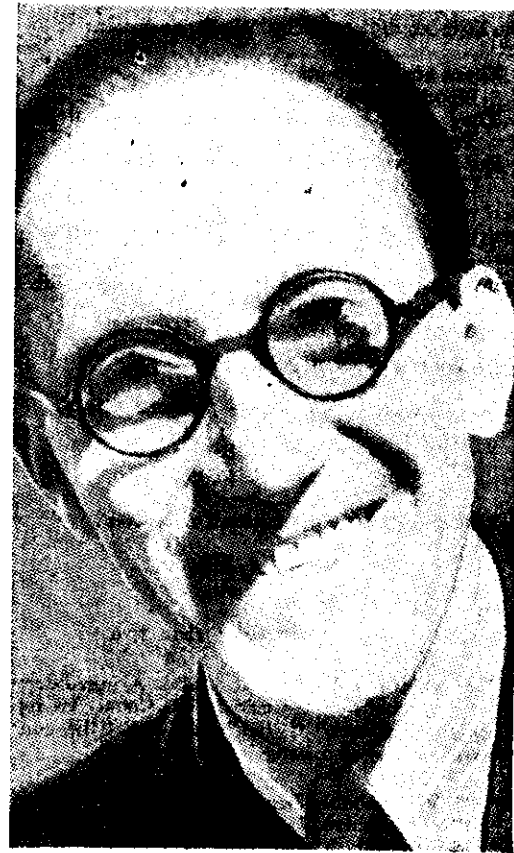
"BIG-HEARTED, that's me!": Arthur Askey, comedy star of the famous BBC feature "Band Waggon" which will be featured on the variety programme from 3YA on Saturday evening, March 23. Big-hearted Arthur and his colleagues will be on the air at 9.25