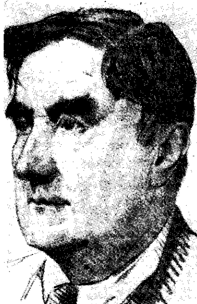
DR. RALPH VAUGHAN WILLIAMS, whose "Serenade to Music," played by the BBC Orchestra, under the baton of Sir Henry Wood (to whom the work was dedicated), will be heard from IYA on Friday evening, February 23

7.0 a.m. Daventry news 7.10 Breakfast session 9.0-9.10 Daventry news 11.0 Light music 12.0-2.0 p.m. Lunch session 12.30 Daventry news 5.0 Light music 5.45 For the Children 6.0 "Pinto Pete in Arizona" 6.15 Daventry news 6.30 Light music 6.45 Weather report and forecast for Hawke's Bay "Dad and Dave" 7.0 Re-broadcast of Government news 7.15 (approx.) Inspector Scott of Scot- land Yard 8.2 Band of H.M. Welsh Guards, "The Gondoliers" Selection