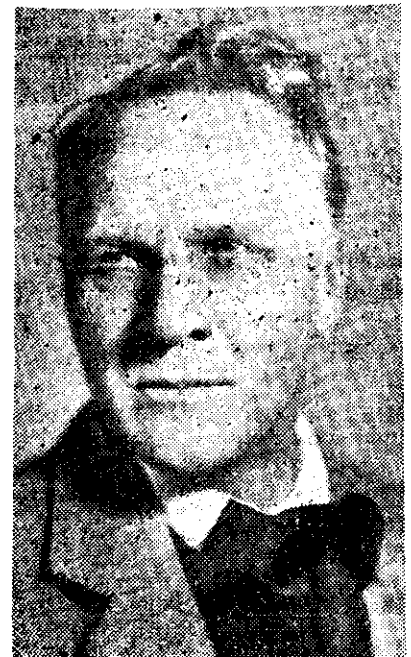
FEODOR CHALIAPIN, the great Russian bass, will be heard from 2YC on Friday evening, February 16, in a feature programme entitled "From the Concert Hall"

8. 0 CONCERT PROGRAMME From the Exhibition Studio: Recording: Ray Noble and his London Orchestra, "Ray Noble Medley"