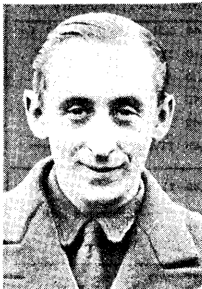
VLADIMIR HOROWITZ (above), the famous pianist, who will be heard from 3YA on Wednesday evening, February 14 with the London Symphony Orchestra, playing "Concerto No. 3 in D Minor, Op. 30," by Rachmaninoff