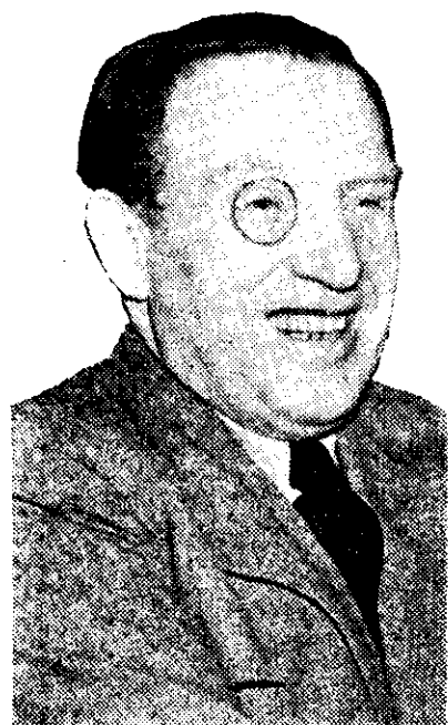
RICHARD TAUBER never fails to please a large proportion of listeners. The popular tenor will be heard from 4YA on Thursday evening, January 25