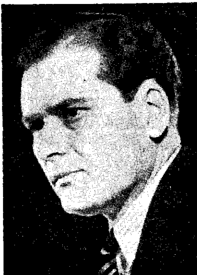
MUIR MATHIESON, who conducts the London Symphony Orchestra recordings broadcast by 3YC at 8.50 this evening