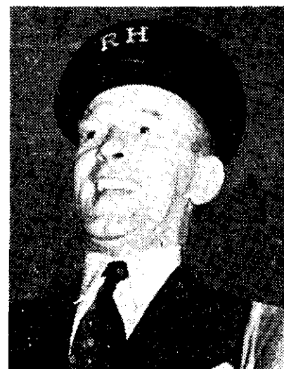
WILFRED PICKLES Southland will be listening

At 10.10 p.m. 2YA will broadcast a recording of a Christmas and New Year's