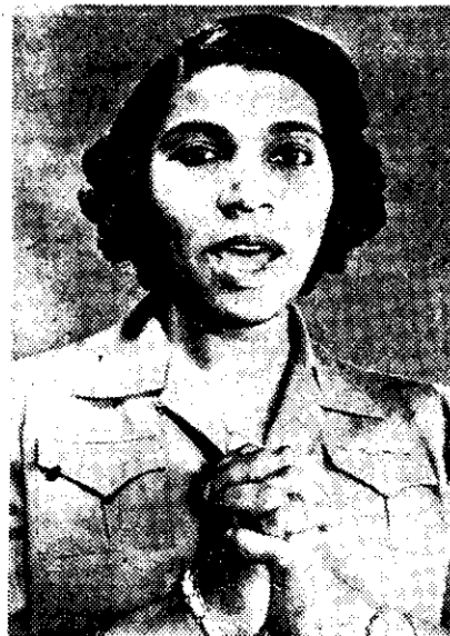
MARIAN ANDERSON (contralto), who will be heard in "If Florian is Ever Faithful" (Scarlatti) at 9.12 this evening during the classical music session from 4YC