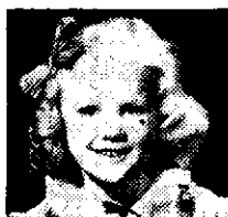
Gorgeous Soft Curls Wonderful for Children