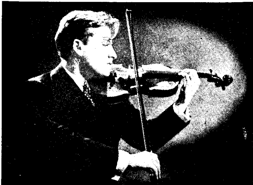
YEHUDI MENUHIN, who is the soloist with the BBC Scottish Orchestra in the Edinburgh Festival programme to be heard from IYA at 7.30 p.m. on Friday, November 25