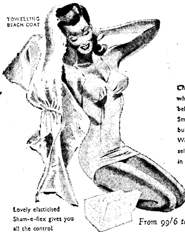
TOWELLING BEACH COAT

Lovely elasticised Sham-e-flex gives you all the control of your favourite foundation, fitting as smoothly as your summer suntan