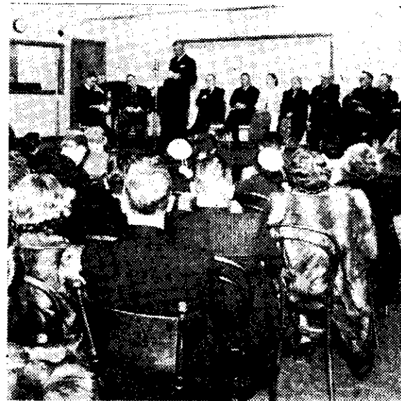
THE MAIN STUDIO of 2XA, photographed during the official opening ceremony