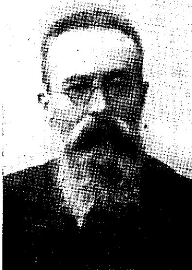
RIMSKY-KORSAKOV, who is featured in 3YA's "Makers of Melody" session beginning at 10.10 this morning