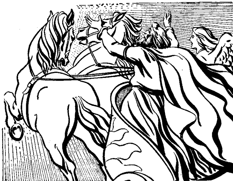
MENDELSSOHN'S ORATORIO "ELIJAH," presented by the Christchurch Harmonic Society, will be heard from 3YA at 8 o'clock this evening, relayed from the Civic Theatre