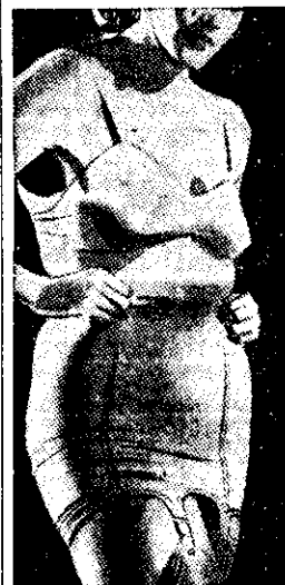
FIGURE FAULTS BANISHED! AMAZING NEW WAY

SLIMFORM, the amazing Latex GIRDLE, gives you lovelier lines, slimming away superfluous flesh, remoulding your figure into new curves, new beauty.