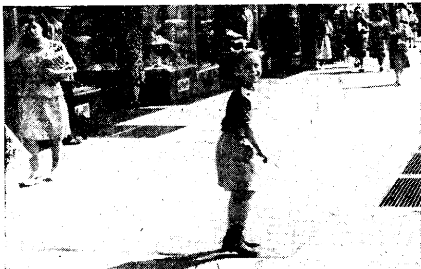
HIS FIRST STEPS in the open—the little crippled boy whose cure provides the theme of the film "FIRST STEPS"