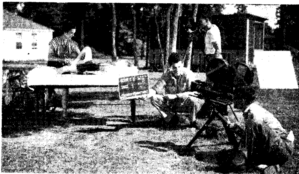
SHOOTING a scene in the UNESCO award-winning documentary "FIRST STEPS"

The Defence of Peace , a French-made film explaining, largely by means of