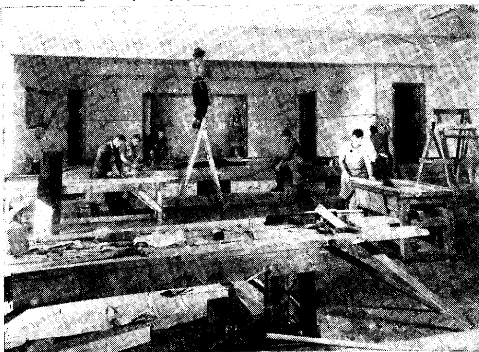
CARPENTERS at work on the radio theatre which will be a feature of the new Wanganui station 2XA. At top: The 124-foot self-supporting mast at Queen's Park which will radiate the 2XA programmes