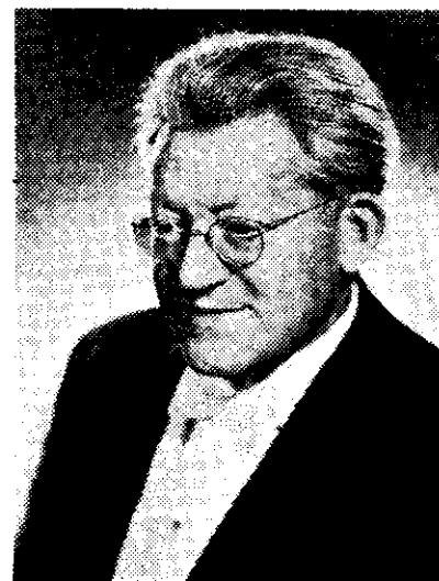
ARTUR RODZINSKI , who conducts the Cleveland Orchestra, heard from 4YC at 8.0 p.m., in Symphony No. 1 in F, Op. 10 (Shostakovich)