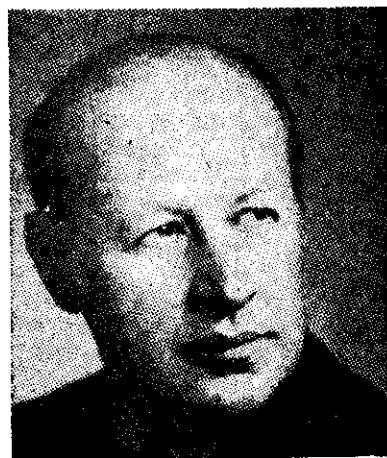
EUGENE GOOSSENS, Conductor of the London Symphony Orchestra, which will be heard from 3YC at 9.14 p.m., during the Symphonic Programme, in "Le Coq d'Or Suite" (Rimsky-Korsakov)