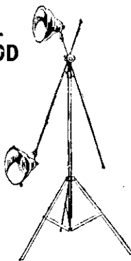
Table Model 37/3